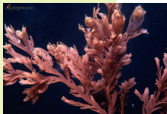
The red alga Plocamium rigidum

Unicellular algae that are the most important photosynthetic active organisms in the oceans.